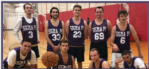
The Rho intramural basketball team.

Undergraduate Brothers Make Their Mark in Raleigh Community